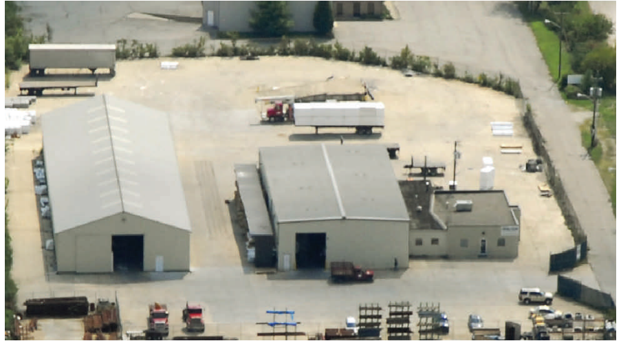
6435 East 30th St.